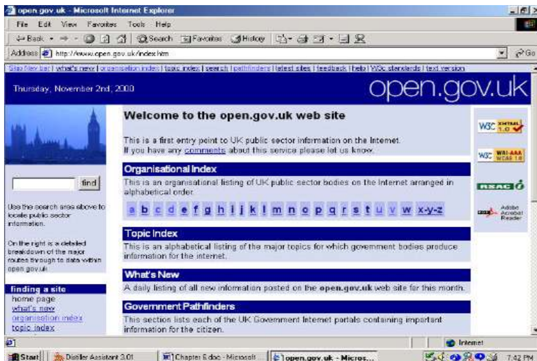
Figure 3. E-governance in UK.