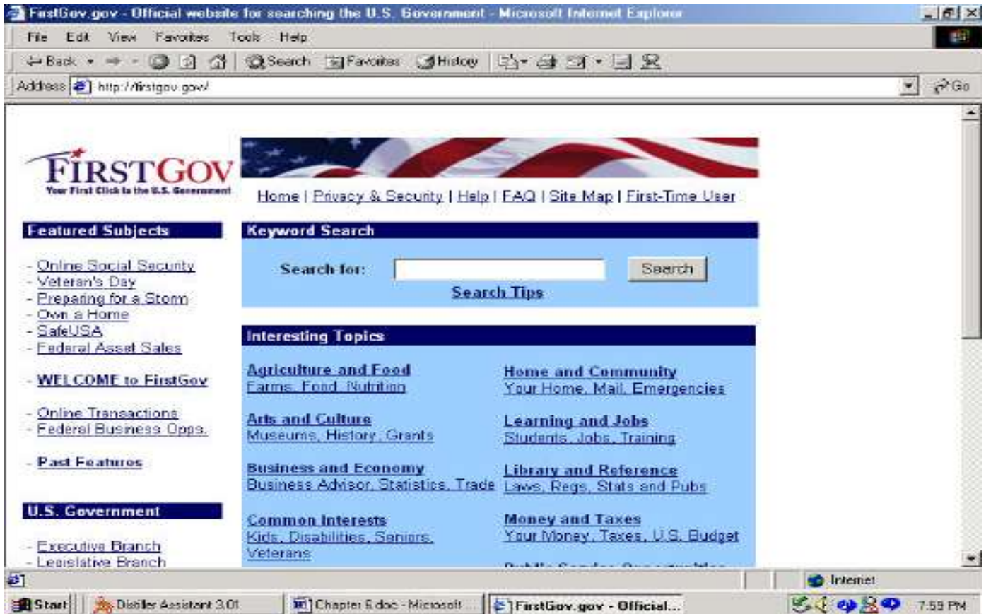
Figure 2. E-Governance in United States of America.