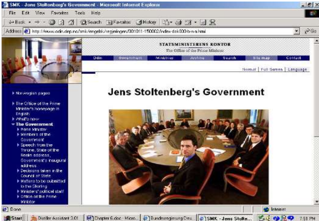
Figure 5. E-governance in Norway.