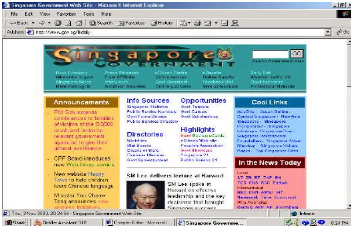
Figure 4. E-governance in Singapore.